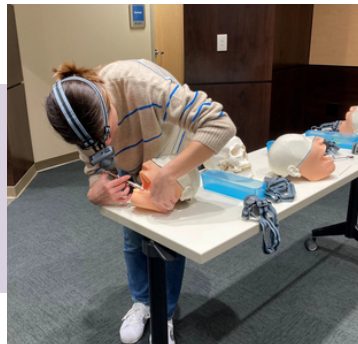
Dental Pain Training

Mental health and substance use prevention at work