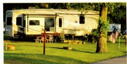
We have over 350 spacious, beautifully maintained sites that vary from rustic tent sites to asphalt pads. 20/30/50 amp service as well as water hookups available.