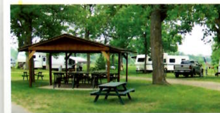
Campers wanting to get together for a pot-luck, cards, or just to visit are welcome to use the campground shelter.