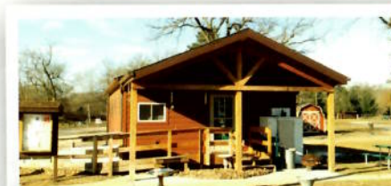
Register right here at the Campground Store. It is our delight to provide our guests with the best quality in service and facilities. Wi-Fi Hotspot surrounds the store.