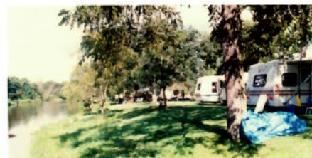
If you canoe, like to fish catfish, or just enjoy looking at the water, you will want to pick a campsite along the La Crosse River.