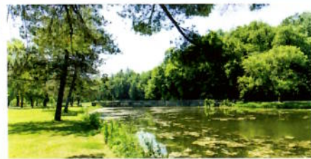
Can you believe it? We have our own four acre fishing pond. Try your luck for a bass, trout or bluegill! Fishing from shoreline only.