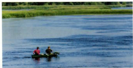
If fishing is your game, Goose Island is the place for you. Ask at the camp store about hot spots and what they're hitting on. The backwaters of the Mississippi are uniquely beautiful.