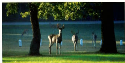
Wildlife abounds around Goose Island. Here a group of deer gather during an early morning feeding. Eagles, ducks, geese and egrets are common as are fox, beaver, raccoon & muskrats.