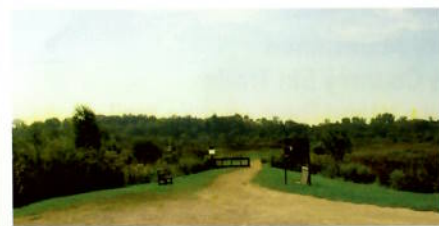
Our campground has direct access to the La Crosse River State Bike Trail. Bike clubs and bicycling families alike find us "the place to camp" when riding the trail.