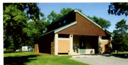
Well-maintained, modern buildings are what you can expect, and get at Veterans. Coin operated showers and flush toilets are what you will find in our restrooms.