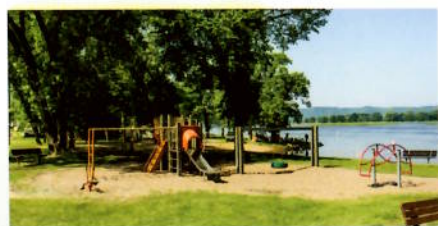
Our beach and playground area provides fun for all on a sandy oasis.