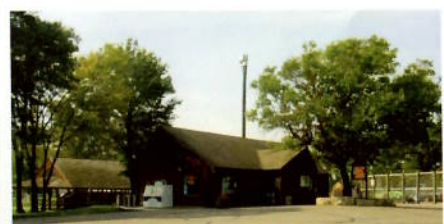
Our log cabin store & gameroom is waiting to welcome you. Register here & also pick up any of those items you may have forgotten. Wi-Fi Hotspot surrounds the store.